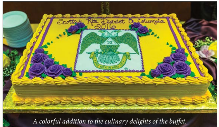
A colorful addition to the culinary delights of the buffet.